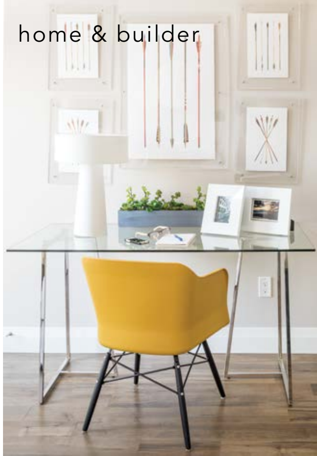
ABOVE: The guest room's art wall echoes the acrylic framing on the master bedroom wall. Here, vintage arrow studies add pop. Acrylic was chosen for its reflective quality that bounces natural light. BELOW LEFT: The lower level walk-out includes a relaxing conversation area, as well as a wet bar and an additional bedroom and bathroom. BELOW RIGHT: The wood-paneled home elevator interior promises a comfortable ride between floors.

The model also includes a finished lower level with a walk-out, wet bar and comfy conversation area surrounding a honed stone fireplace. Stephanie explains how she used the basics of transitional decorative styling to create a modern edge within a timeless interior. To complement natural maple floors, she added a waterfall counter in the kitchen to meet the natural grain of the hardwood. She chose the warm tones of Simply White and Collingwood (Benjamin Moore) as the model's main palette. Then she dropped in touches of grey, such as the fireplace surround in the living room, and mixed the neutral scheme with saturated bright colour in greenery, accessories and artwork.