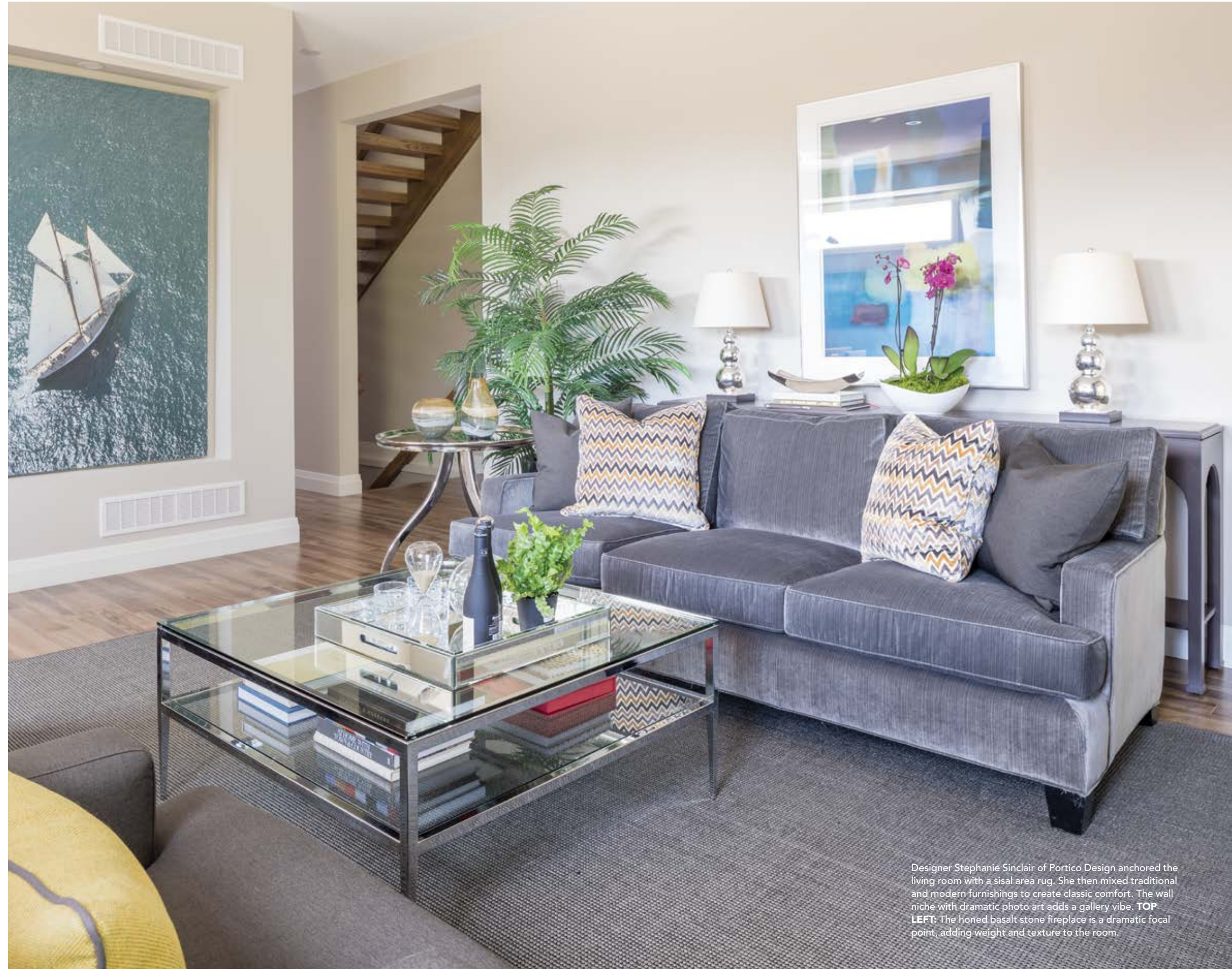
Designer Stephanie Sinclair of Portico Design anchored the living room with a sisal area rug. She then mixed traditional and modern furnishings to create classic comfort. The wall niche with dramatic photo art adds a gallery vibe. TOP LEFT: The honed basalt stone fireplace is a dramatic focal point, adding weight and texture to the room.

He recalls, "The first time I showed up on site I said, I have to develop this." Today, seven two-floor detached units in Oakridge Common have been constructed and one is finished as a model home, open to view for inspiration since the other interiors will be custom finished once purchased. Continued on page 25